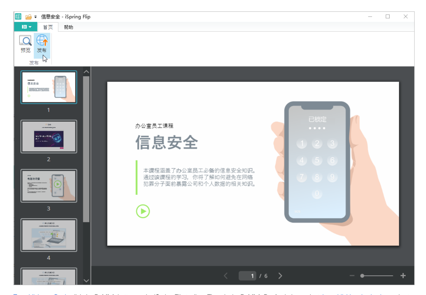
To publish an eBook, click the Publish button on the iSpring Flip toolbar. Then, in the Publish Book window, select the publishing destination and set up output options. Next, click the Publish button.